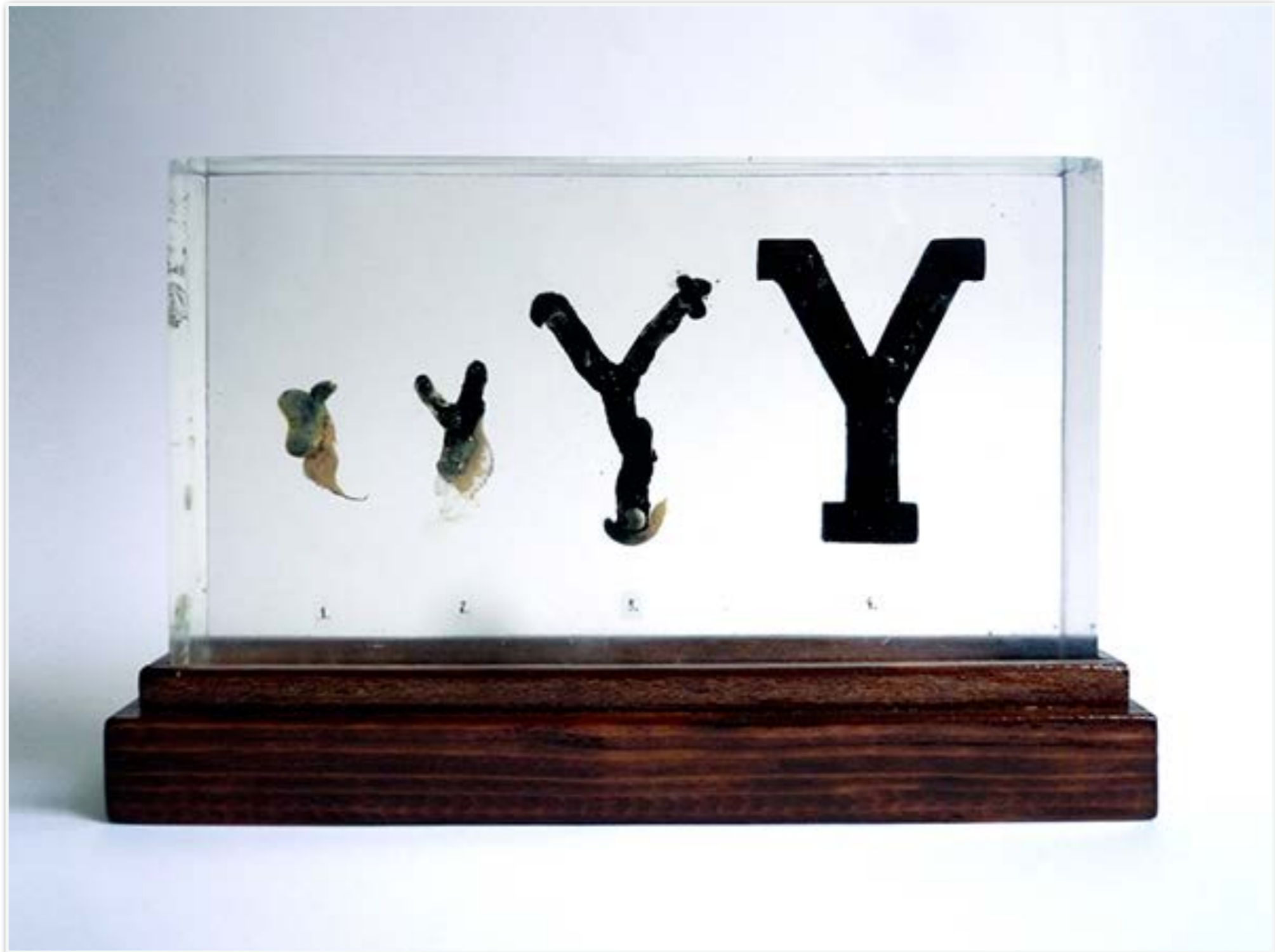
Evolution of Type