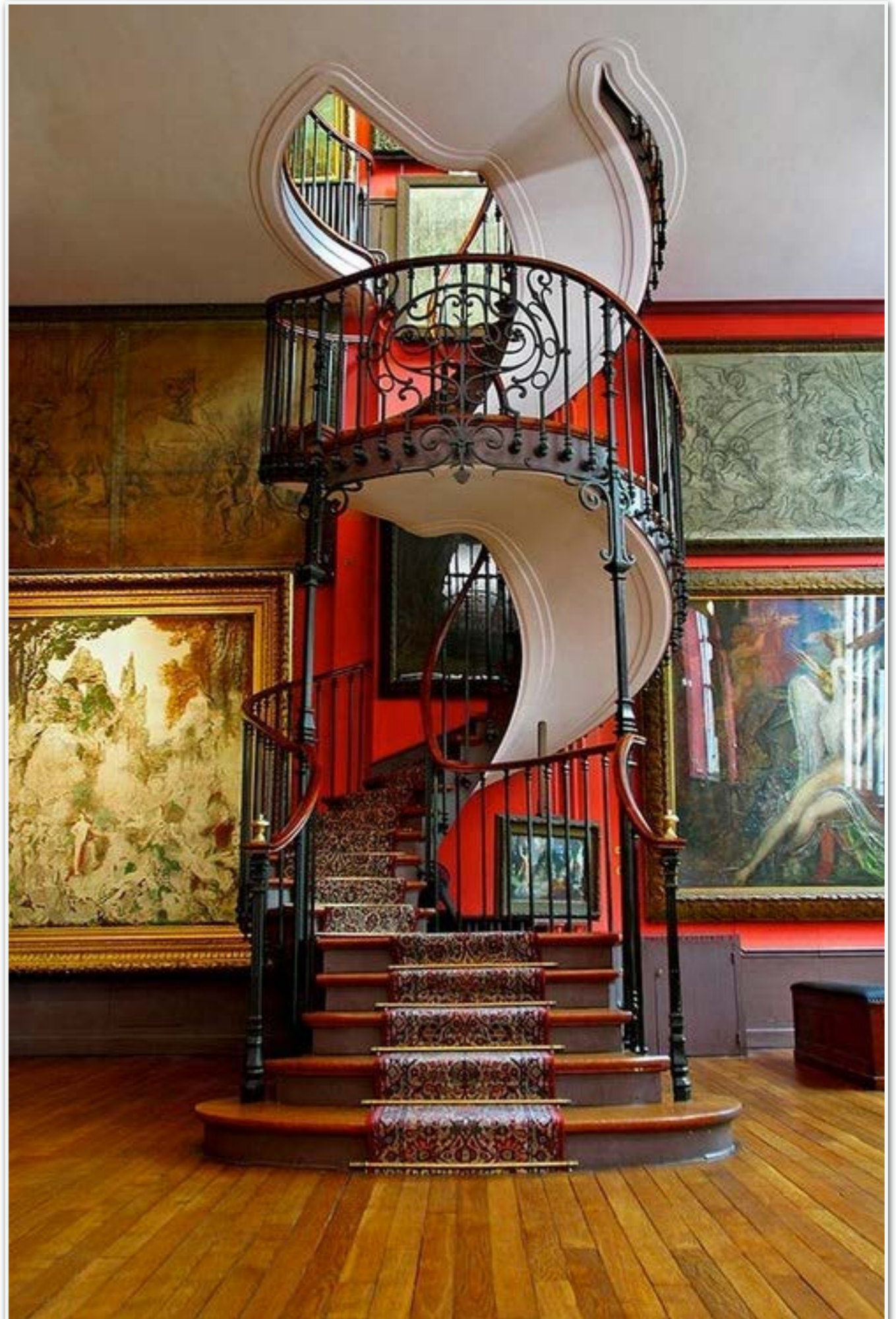
Spiral Staircase, National Museum of Paris